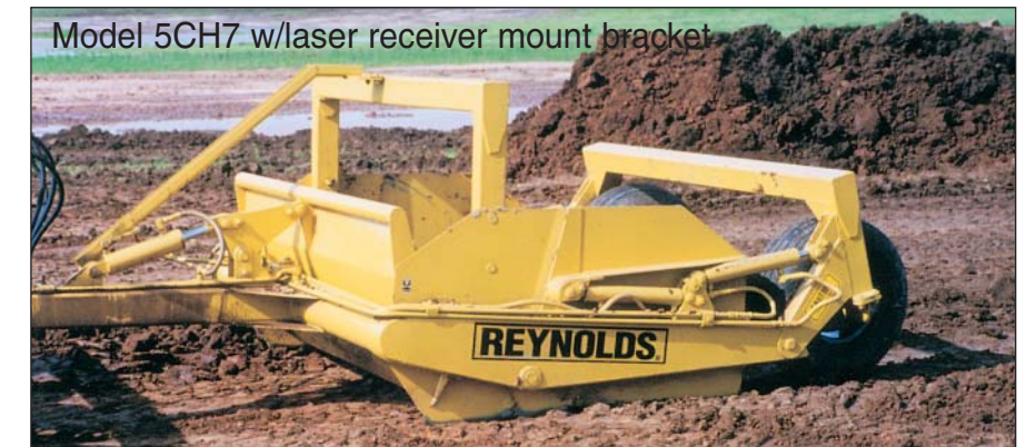
Model 5CH7 w/laser receiver mount bracket

Laser mount bracket (5CH). Swivel or yoke type hitch.