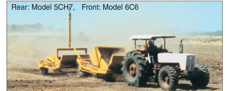
Rear: Model 5CH7, Front: Model 6C6

REYNOLDS INTERNATIONAL, L.P., P.O. Box 550, McAllen, Texas 78505-0550 USA