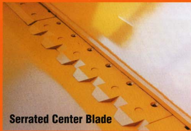
Serrated Center Blade

3-piece BORON STEEL cutting blade with a center stinger makes it easy to load the bucket. A reversible, serrated Boron steel stinger blade is standard.