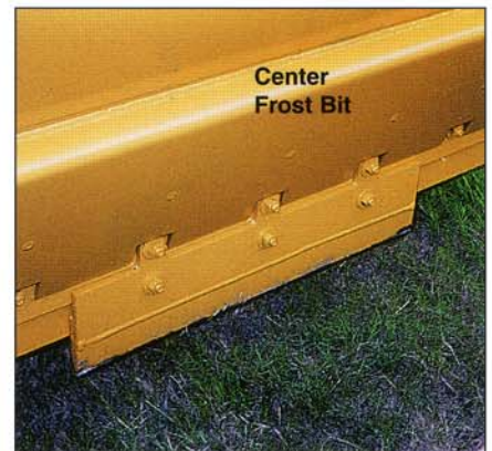
Center Frost Bit