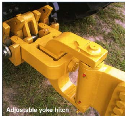
Adjustable yoke hitch